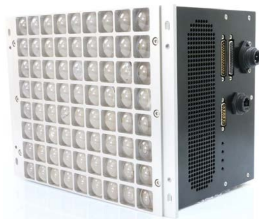
Ethernet communication Great Homogeneity & Small Collimation Angle